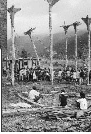
Right — Kokoda villagers erecting the platform used in the opening ceremony. Each village in the district cut and decorated a tree, carried it to the site and then, in one afternoon, with much ceremony and straining set them up as shown. Jungle vines were used to pull the trees upright and smaller vines then used to lash the platform in place.