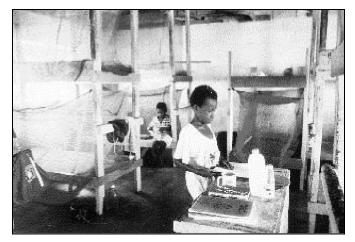
Bednets impregnated to combat malaria are used in boarding schools in \ensuremath{\mathsf{Vanuatu}}\xspace.